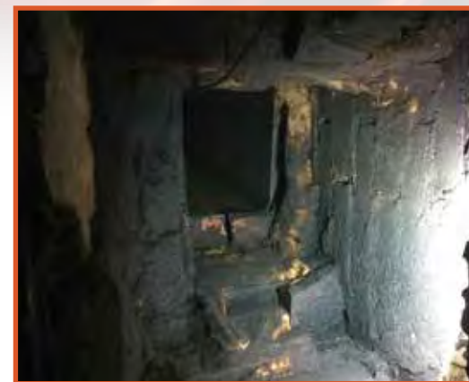
Exposed Brick Before Chamber Coat Application