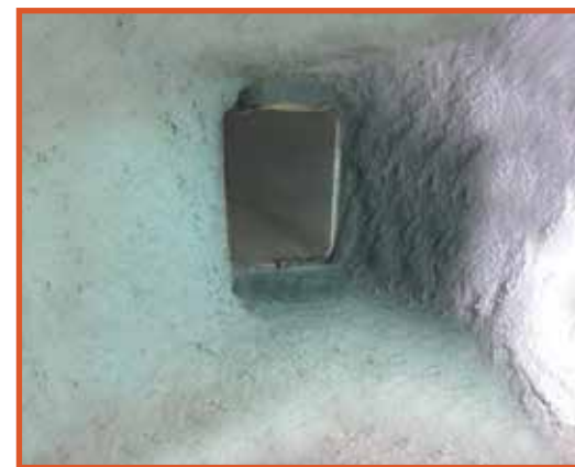
Chamber Coat Application Seals Gaps, Cracks, Holes, and Streamlines Smoke Chamber Walls