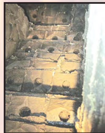
Jagged Corbelling and Exposed Brick Cores (Holes) in a Smoke Chamber

According to the National Fire Protection Association (NFPA), defective smoke chambers are the third leading cause of chimney related house fires. For the safety and efficiency of your fireplace, it is important that any gaps, cracks, or holes in the smoke chamber be sealed and the brick corbelling be made smooth. Because the smoke chamber is a "high heat" area, any gaps, cracks, or holes can allow excessive heat to attack any surrounding wood or combustibles. The jagged corbelling slows the draft and will provide more surface area for highly combustible creosote and soot to form.