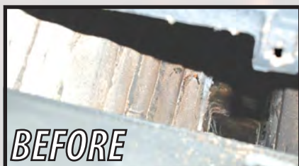
Exposed Brick Corbells Before HeatShield Cerfractory Foam

HeatShield Cerfractory Foam Smoke Chamber Sealant is a high-temperature, expandable foam. It's applied using a specially designed sprayer to coat the walls of your smoke chamber, restoring the integrity of your fireplace. It seals gaps, cracks, and smoothes up any jagged and corbelled brick edges.