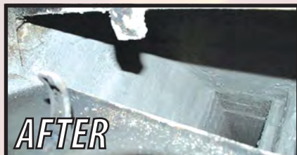
HeatShield Cerfractory Foam Application Seals Gaps, Cracks, Holes, and Streamlines Smoke Chamber Walls