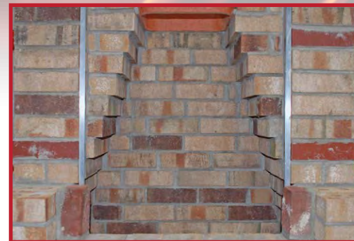
Exposed smoke chamber walls before Cerfractory Foam application