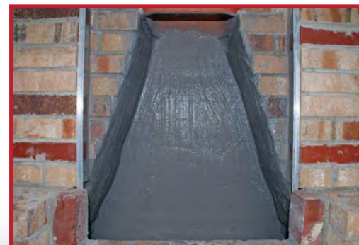
Smoke chamber walls after being parged smooth with Cerfractory Foam.