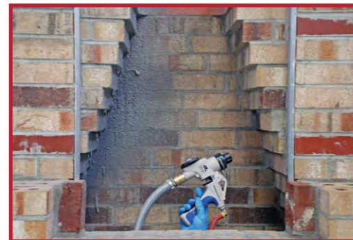
Cerfractory Foam application seals gaps, cracks, holes and streamlines smoke chamber walls